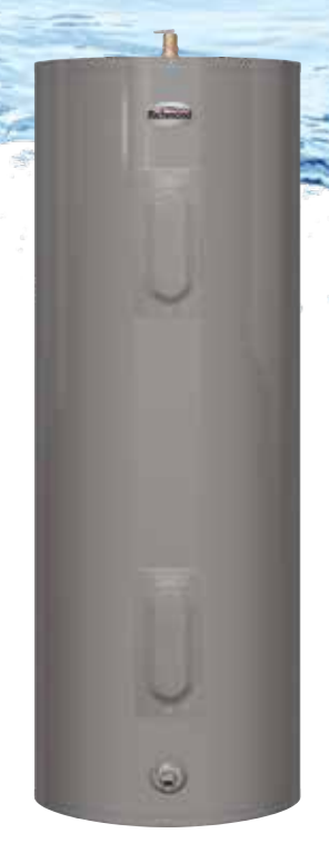
Essential 28, 30, 36, 38, 40, 47 and 50-Gallon Capacities 240 Volt AC/Single Phase Electric